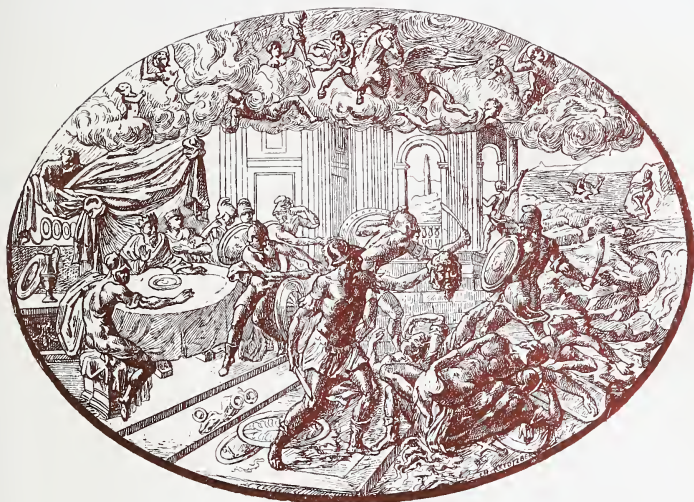
SILVER MEDALLION.—DEATH OF MEDUSA.